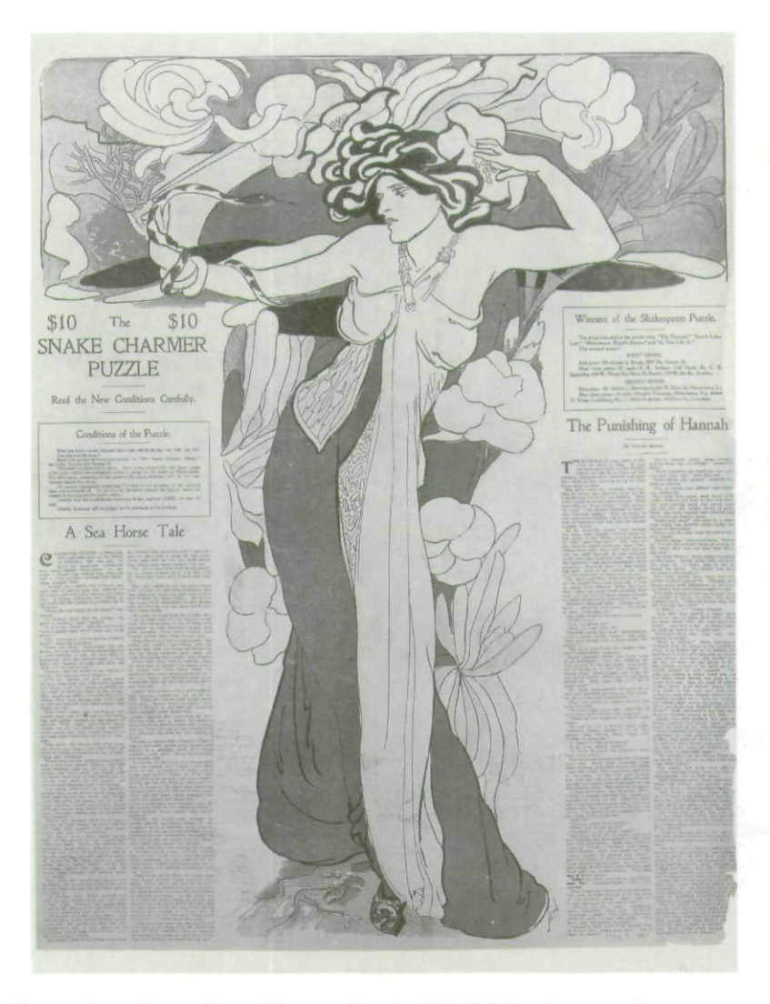
Fig. 4. John Sloan, Snake Charmer Puzzle , Philadelphia Inquirer , May 5, 1901. Color line cut reproduction, 22<sup>3</sup>/8 in. x 17<sup>3</sup>/4 in. John Sloan Collection, Helen Farr Sloan Library, Delaware Art Museum.