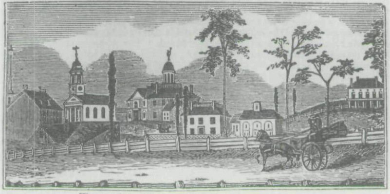
View at the north entrance to the village of Worcester.