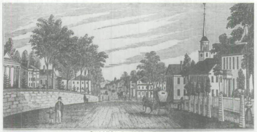
MAIN STREET IN WORCESTER, MASS.

The above is a view taken at the south-western entrance of the Main street in Worcester. The old South Church and the Town-House appear on the right. A number of private residences are seen on the left. Main street is seen extending in the distance to the northward.