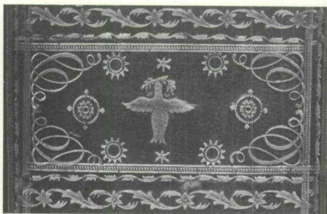
Detail from spine of the Isaiah Thomas folio Bible, reproduced full size.