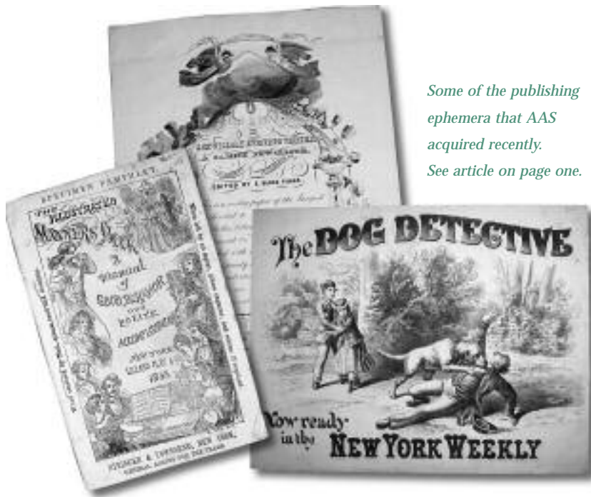
Some of the publishing ephemera that AAS acquired recently. See article on page one.