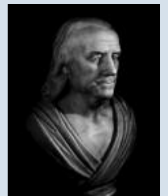
Bust of Benjamin Franklin