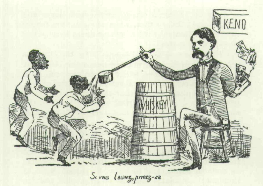
A "RECONSTRUCTION" GOVERNOR DEPICTED AS RECEIVING MONEY FROM GAMBLERS AND FEEDING WHISKEY TO NEGROES. From Le Carillon

1866 is missing from the otherwise complete files in the Archives of the New Orleans City Hall, and I have