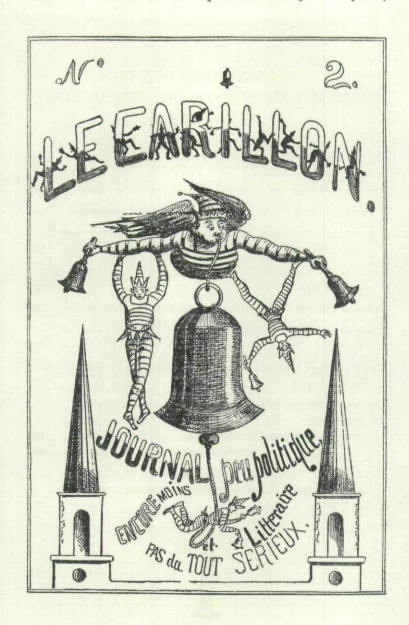
COVER OF SECOND ISSUE OF Le Carillon